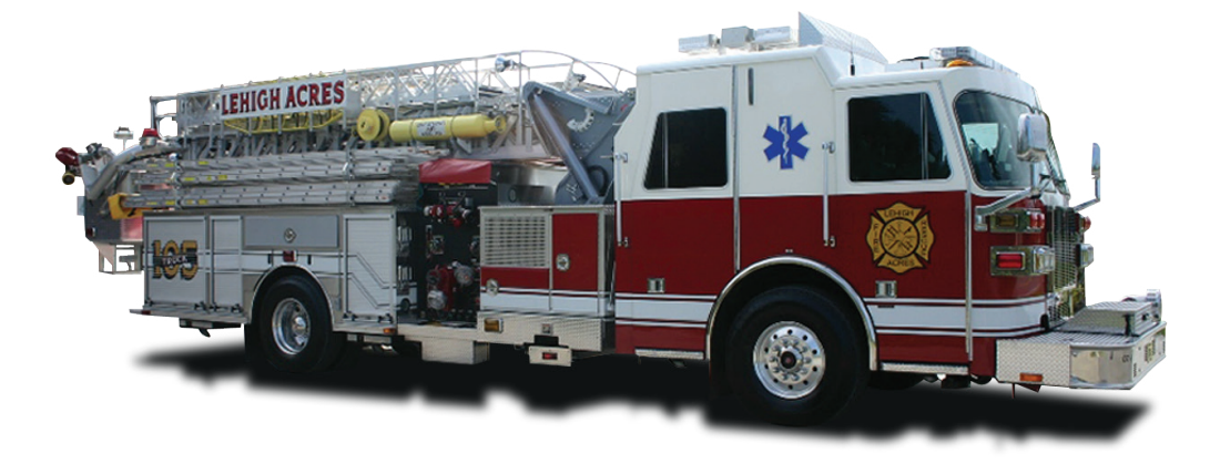
211 cubic feet of compartment space 80 cubic feet of hosebed Two crosslays - 1 3/4" - 300' capacity for each Up to 500 gallon tank Aerial ground ladders